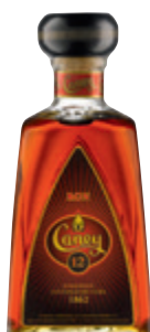
12 Años Page 22