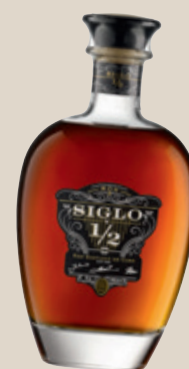
SIGLO y 1/2 Page 34