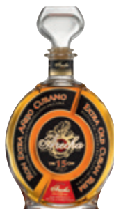
Extra Añejo 15 Años Page 26