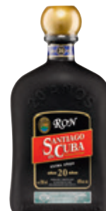
Extra Añejo 20 Años Page 33