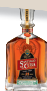
Extra Añejo 25 Años Page 33